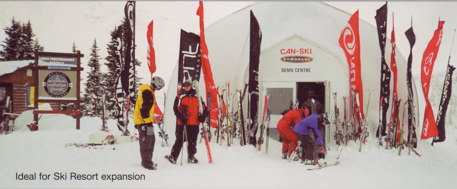
Ideal for Ski Resort expansion

On hill demo centers - Whistler Blackcomb, British Columbia, Canada