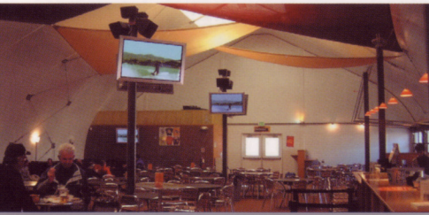
Food and beverage facilities