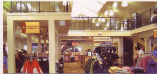
Rental/retail shop expansion