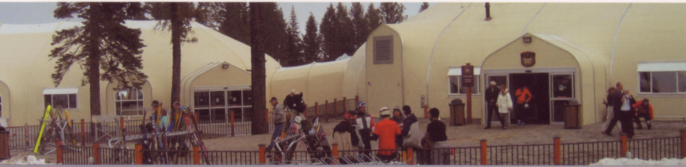
Five fully insulated Sprung structures located at Tamarack Resort, Idaho

On hill demo centers - Whistler Blackcomb, British Columbia, Canada