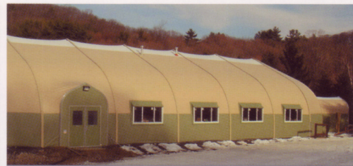
Day lodge expansion